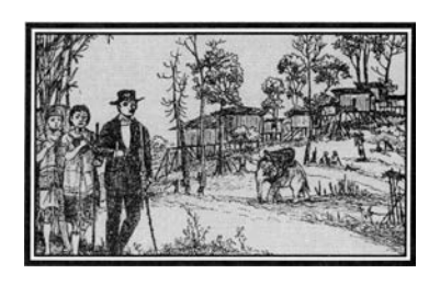
north of Moulmein, 1832