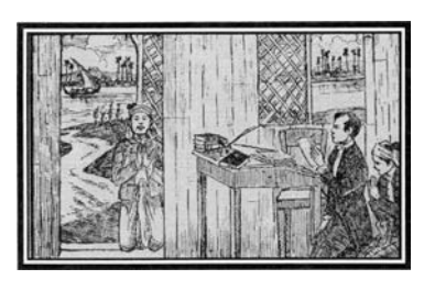
Judson visit Karen villages Judson dedicates the completed Burmese Bible, 1834