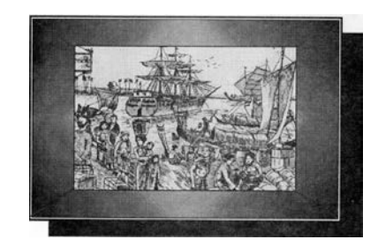
Stained-glass window portraying the Judsons The Judsons arrive in Rangoon departing Salem February 19, 1812 July 13, 1813