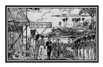
Judson interprets at Treaty of Yandabo, 1826