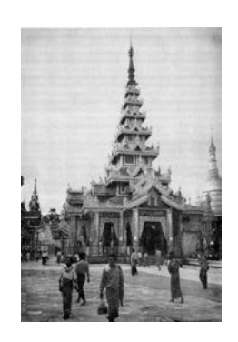
"Ask of me, and I shall give thee the heathen for thine inheritance, and the uttermost parts of the earth for thy possession."—Psalm 2:8